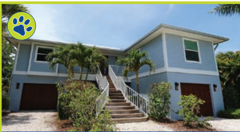
BLUE LAGOON 1307 Par View Drive