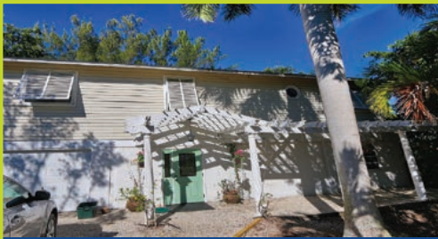
ANHINGA HOME AT SEA OATS 613 Sea Oats Drive