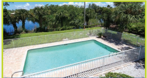
SUN DAZE 453 Lake Murex Circle