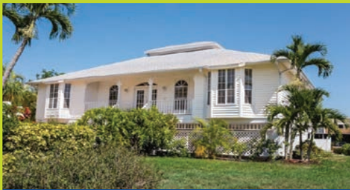
SAND CASTLE 497 East Gulf Drive