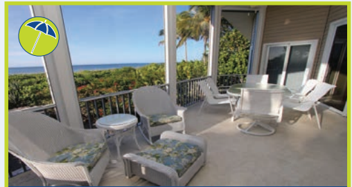
PARENT BEACH HOUSE 3449 West Gulf Drive