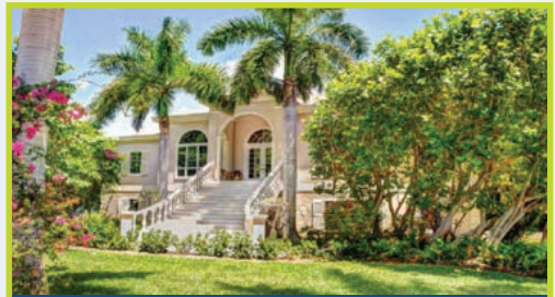
BEL HAVEN 527 Kinzie Island Court