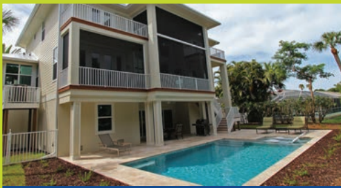
ANGELFISH 1208 Par View Drive