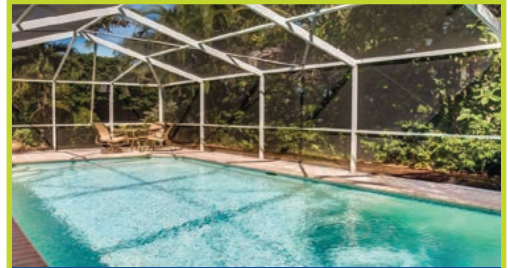
ISLAND TIME 820 East Gulf Drive