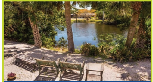
TURTLE BAY COTTAGE 4044 Coquina Drive