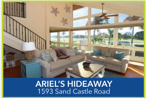
ARIEL'S HIDEAWAY 1593 Sand Castle Road