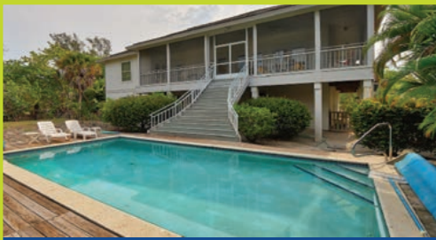
KASPAR HOME 1129 Seagrape Lane