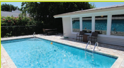
AGATE ABODE 3724 Agate Court