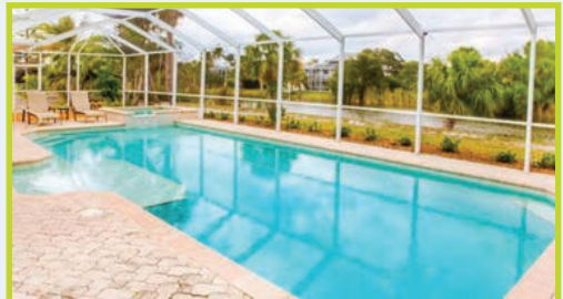
LITTLE DREAM 566 Boulder Drive