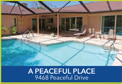
A PEACEFUL PLACE 9468 Peaceful Drive