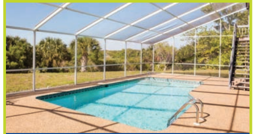
TURTLEHOUSE 570 Lake Murex Circle