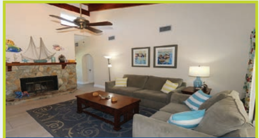
VILLE MARE 6451 Pine Avenue