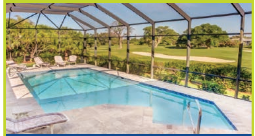
ISLAND PALM 1255 Par View Drive