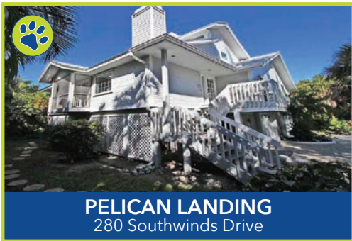
PELICAN LANDING 280 Southwinds Drive