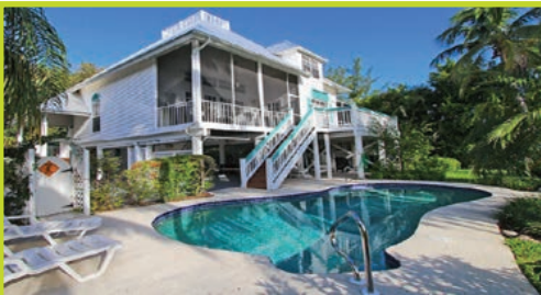
KEY WEST 862 Beach Road