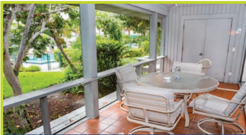
DONAX VILLAGE 11 723 Cardium Street