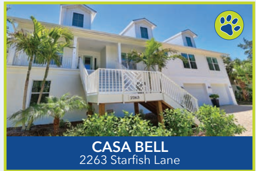
CASA BELL 2263 Starfish Lane