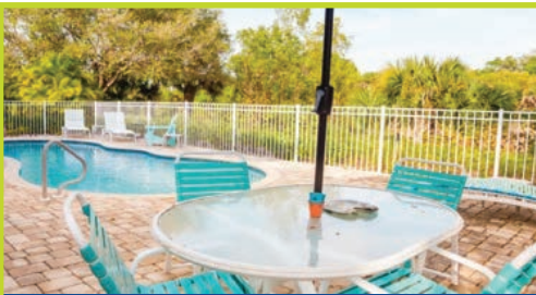
PALMS BY THE SHORE 3312 Saint Kilda Road