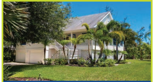
A SUN BURST 490 Lake Murex Circle