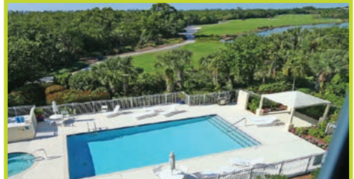
GOLF VILLAGES AT THE SANCTUARY #5 2619 Wulfert Drive