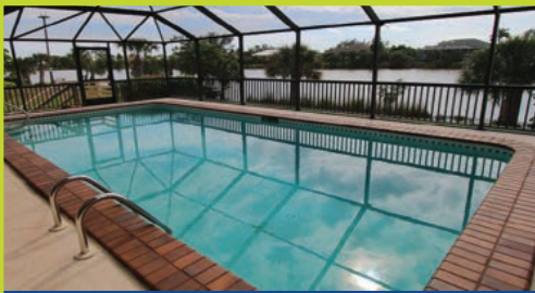
HOMEBASE 2 553 Lake Murex Circle