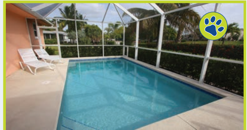
SHELL BASKET 2 1137 Shell Basket Lane