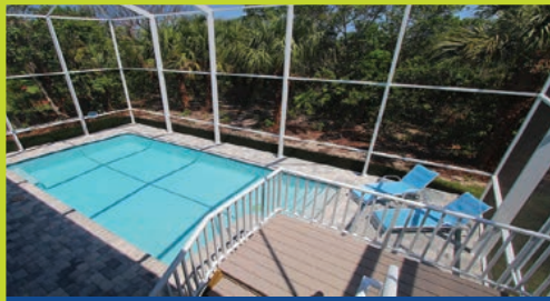
HAVEN HOUSE 3761 Coquina Drive