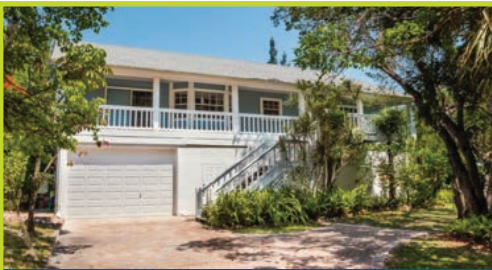
TREE HOUSE 6054 Dinkins Lake Road