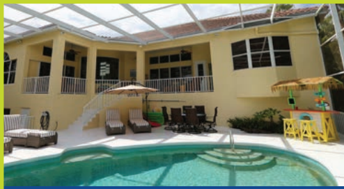
B & J'S GETAWAY 232 Robinwood Circle