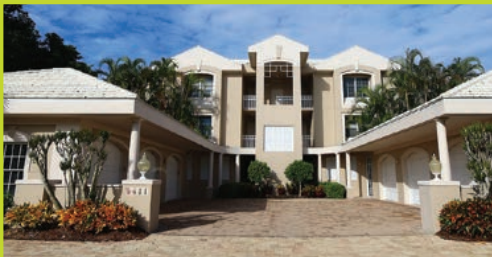
HERON 1B AT THE SANCTUARY 5681 Baltusrol Court