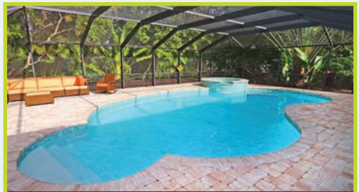
BOBCAT BUNGALOW 1549 Wilton Lane