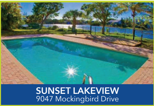
SUNSET LAKEVIEW 9047 Mockingbird Drive