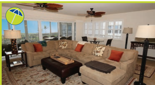
HIGH TIDE A102 2659 West Gulf Drive