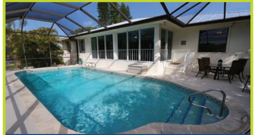
DURION 660 Durion Court