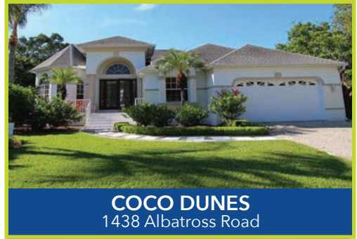
COCO DUNES 1438 Albatross Road