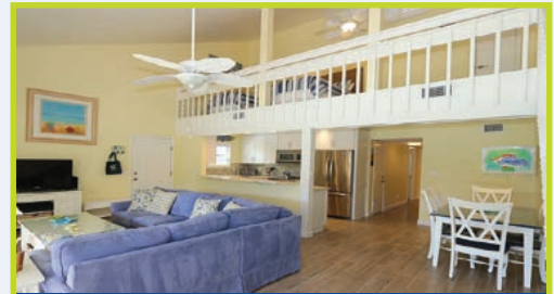
DONAX VILLAGE 04 742 Donax Street