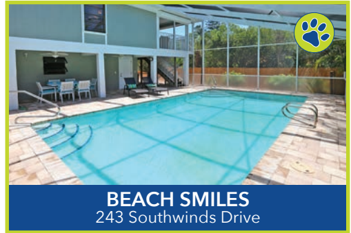
BEACH SMILES 243 Southwinds Drive