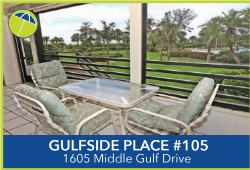
GULFSIDE PLACE #105 1605 Middle Gulf Drive