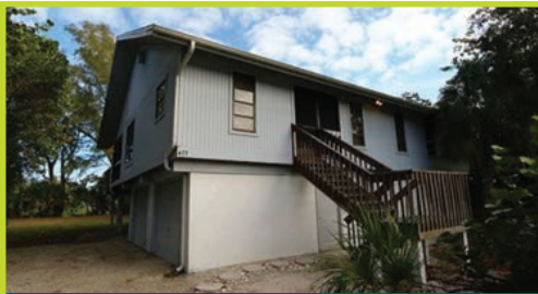
CASA TRANQUILA 477 Lake Murex Circle